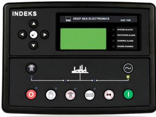
Photo may be demonstration or a different size generator