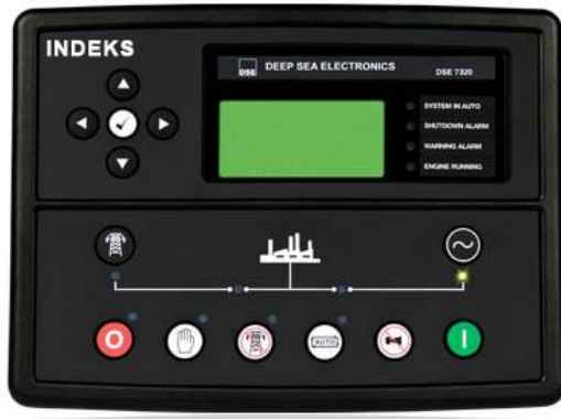
Photo may be demonstration or a different size generator