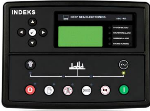
Photo may be demonstration or a different size generator