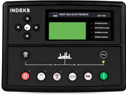
Photo may be demonstration or a different size generator