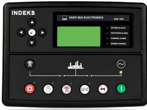
Photo may be demonstration or a different size generator